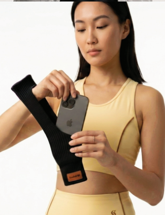
Capri Short WBA-CM26

From bold to tonal, Capri comes in a full spectrum — so there's always a color that fits the brand.