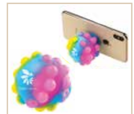
Push Pop Ball Suction Cup Phone Stand WGA-BA26