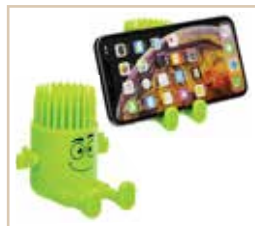
Bristle Buddy Flexible Phone Stand WTE-BB26