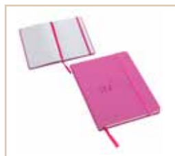
Spectrum Hard Cover Journal WOF-SP23