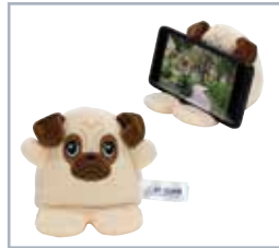
Pug Weighted Plush Phone Holder Phone Pals™ PHP-PU26