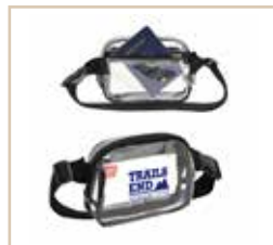
Envoy Clear PVC Waist Bag WBA-EN26