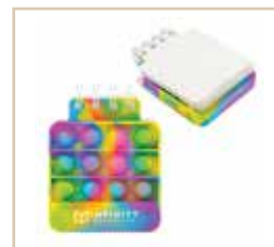
Square Push Pop Spiral Notebook WOF-PS26