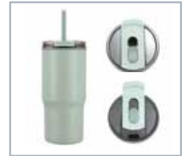
Marli 20 oz 2-in-1 Eco-Friendly Tumbler DTM-ML26