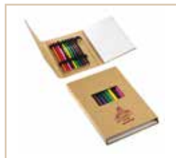
Artisan Sketch Pad with 10-Piece Colored Pencil Set WOF-AR26