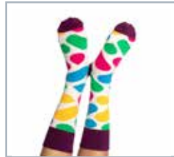
Custom Crew Socks WSC-SC26