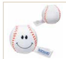
Baseball Stress Busters™ SSP-BS20