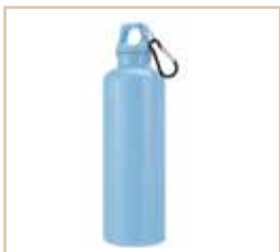
Aloha 25 oz RPET Reusable Bottle w/ Carabiner DBT-AO26