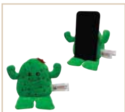
Cactus Weighted Plush Phone Holder Phone Pals™ PHP-CA25