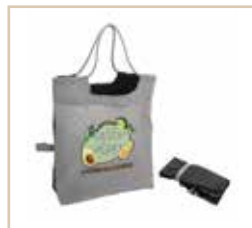
Boulevard Foldable Ripstop Tote with Cinch Cord Handles WBA-BV26