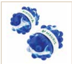
Push Pop and Spinner Ball WGA-PS26