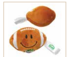
Football Stress Busters™ SSP-FB20