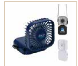
Whirlwind Mini Folding Rechargeable Fan with Lanyard WTV-WW25