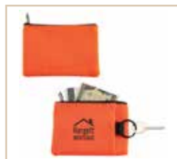
Stash Key Wallet AeroLOFT® ALB-SK22