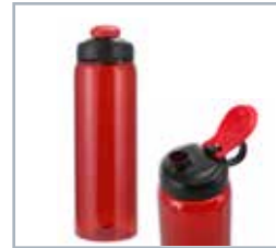
Josi 25 oz RPET Reusable Sports Bottle DBT-JS26