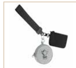
Vogue Wrist Wallet Set WBA-VO25