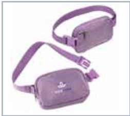
Anywhere Belt Bag AeroLOFT® ALB-AB22