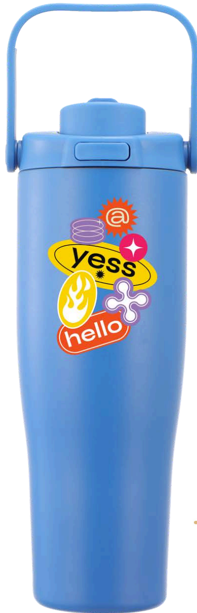
ALAIA 🌿 30 oz 2-in-1 Recycled Stainless Steel Vacuum Tumbler

This bottle features a body made from 100% recycled PET, along with a lid, flap closure, and carry handle crafted from 100% recycled PP. A secure screw-on lid with a flap seal helps prevent spills, while the built-in finger loop offers easy grab-and-go portability. The wide-mouth opening makes filling, cleaning, and adding ice cubes simple.