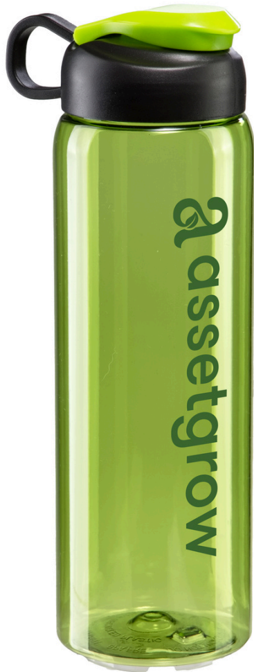
JOSI 🌿 25 oz RPET Reusable Sports Bottle