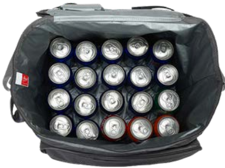
Holds 35-40 standard 12 oz cans

This collapsible cooler features a PEVA-lined interior and foam insulation to keep contents cool. Its molded hardshell lid doubles as a tabletop with cup holders and a device slot. Designed for convenience, it folds flat and includes a shoulder strap for easy storage and transport—perfect for road trips, tailgates, and outdoor events.