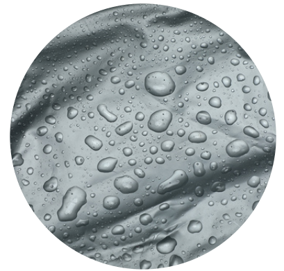
Water-resistant interior lining