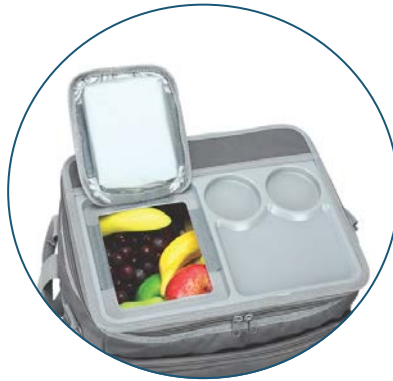
Hook and loop lid top for quick access to inside foods and drinks